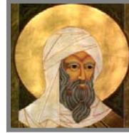
St. John Of Damascus