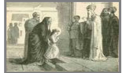
PRESENTATION OF THE BLESSED VIRGIN MARY