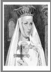
ST. MARGARET OF SCOTLAND & ST. GERTRUDE