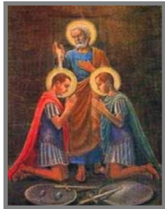
Ss. NEREUS & ACHILLEUS