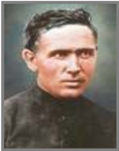
Blessed Damien Joseph de Veuster