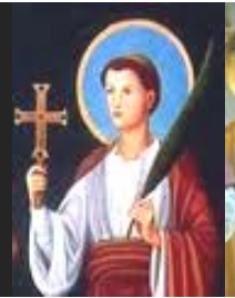
ST. CHARLES LWANGA & COMPANIONS