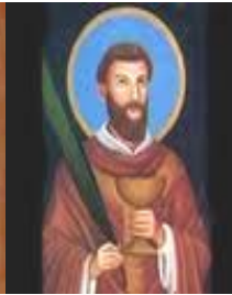
Ss. MARCELLINUS & PETER