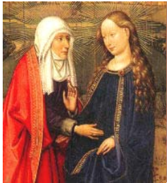
VISITATION OF THE BLESSED VIRGIN MARY