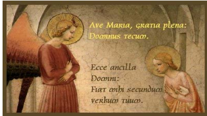
THE ANNUNCIATION OF THE LORD THURSDAY