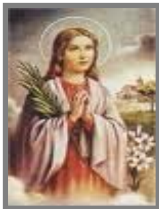
ST. MARIA GORETTI