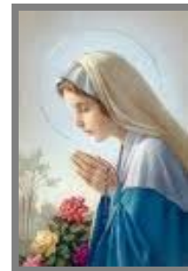
BLESSED VIRGIN MARY