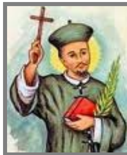
ST. AUGUSTINE ZHAO RONG & HIS COMPANIONS