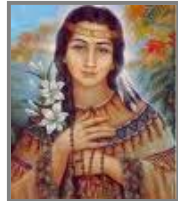
BLESSED KATERI TEKAKWITHA WEDNESDAY