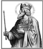
ST. HENRY TUESDAY