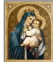
OUR LADY OF MOUNT CARMEL FRIDAY