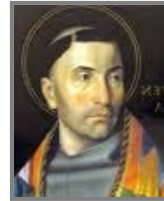
ST. BONAVENTURE THURSDAY