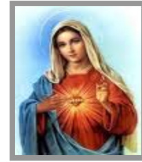
THE IMMACULATE HEART OF MARY