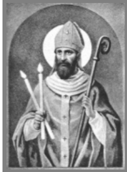
ST. BLAISE, BLESSING OF THE THROATS