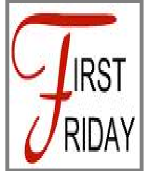
and FIRST FRIDAY