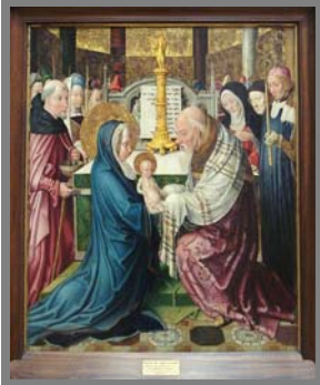
THE PRESENTATION OF THE LORD