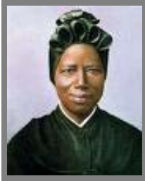
ST. JEROME EMILIANI & ST. JOSEPHINE BAKHITA