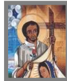
ST. JUAN DIEGO