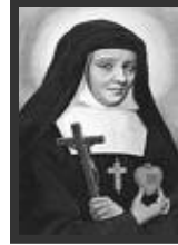
ST. JANE FRANCIS