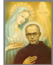
ST. MAXIMILIAN MARY KOLBE