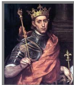
ST. LOUIS OF FRANCE