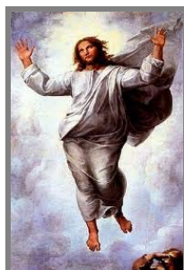
TRANSFIGURATION OF OUR LORD