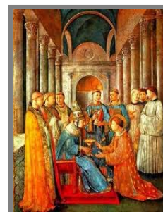
ST. SIXTUS II & COMPANIONS